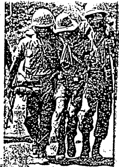
CAMBODIAN TROOPS AT PICH NH PAK