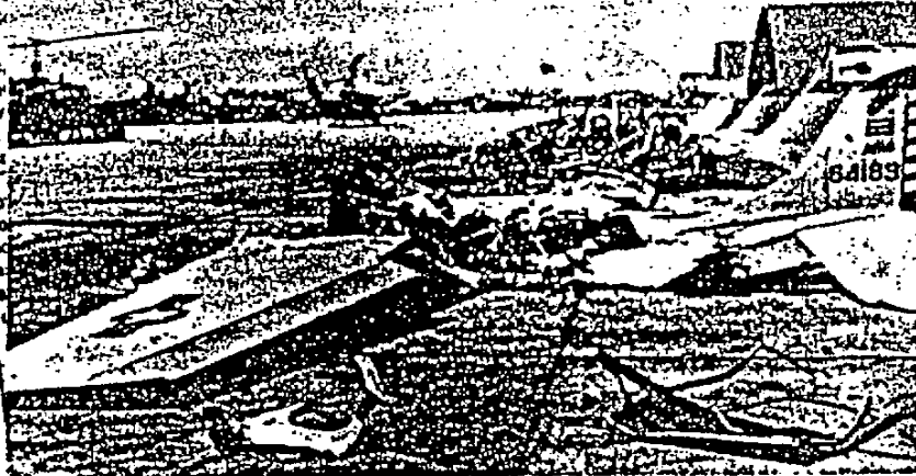
CRUMPLED ALLIED PLANES AT PHNOM-PENH'S POCHENTONG AIRPORT